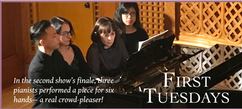
In the second show's finale, three pianists performed a piece for six hands—a real crowd-pleaser!