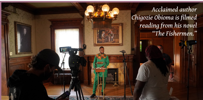
Acclaimed author Chigozie Obioma is filmed reading from his novel "The Fishermen."